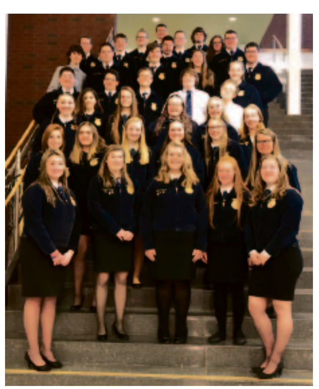
The Midd-West FFA celebrated another year of awards and